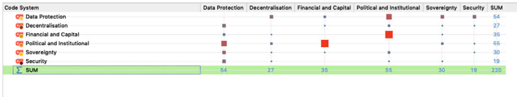
Figure 2. Code relation matrix created from interview transcripts with all experts. Manually coded themes related to identifying problems and challenges were tagged, and their relationship with other themes are visualized based on how often they overlap, demonstrating how certain challenges are linked together. The most prominent relationships are political and institutional–financial and capital as well as political and institutional–data protection. Data protection issues also demonstrate some overlap with other problems and challenges more generally.

that working with stakeholders of different backgrounds helped everyone better understand how a commons should be implemented and could be beneficial for reaching data protection goals. Our interview findings are addressed thematically below by each research question.